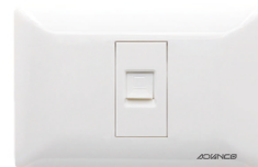
Power : <36V V18DN : 1 Way Computer Socket