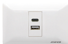
Input : 10A 220V~ Output : PD20W