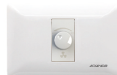
Power : 300W 220V~ V18TG : Dimmer Switch