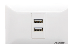
Power : 2.1A 5V~ V182USB : Double USB Charger Socket