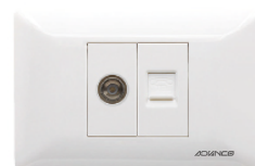
Power : <36V V18TV/DH : Television & Telephone Socket