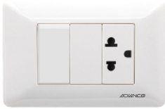
Power : 16A 250V~ V181K163MS : 1 Gang Double Pole Switch