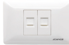
Power : <36V V18DH/DN : Telephone & computer Socket