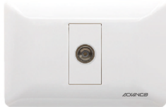
Power : <36V V18TV : 1 Way Television