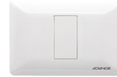
Power : N/A V18MB : Front-plate