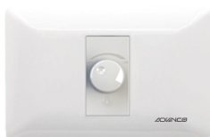
Power : 300W 220V~ V18TS : Fan Speed Controller Switch