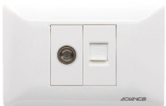
Power : <36V V18TV/DN : Television & Computer Socket