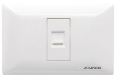
Power : <36V V18TV : 1 Way Telephone Socket